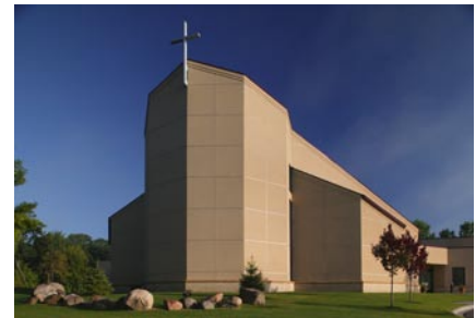
Crown of Life Lutheran Church & School