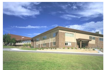
Salem Evangelical Lutheran Church & School