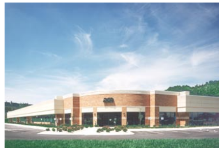
Plymouth Business Center