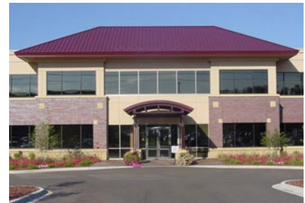
Grand Oaks 8