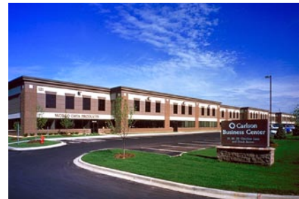
Carlson Business Center