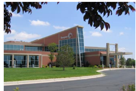
Seagate Technology, Longmont