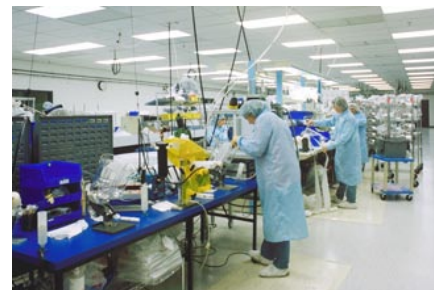
Medtronic Perfusion Systems (Avecor)