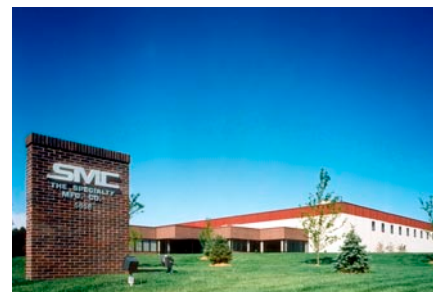
Specialty Manufacturing Company