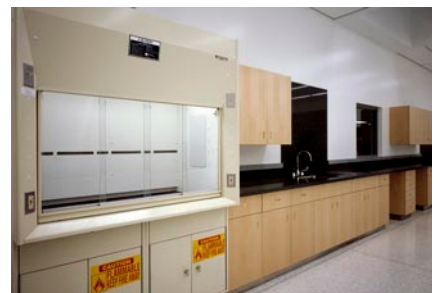
Aveda Pilot Complex