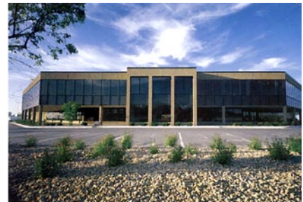
Bureau of Engraving