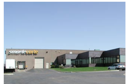
Smarte Carte Inc.