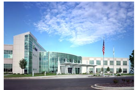
Seagate Technology TCO