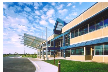
New Flyer Bus Company