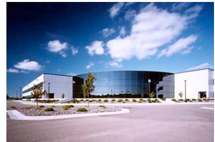
Hutchinson Technology Inc .