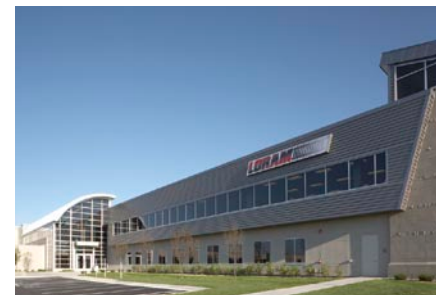
Loram Maintenance of Way, Inc.