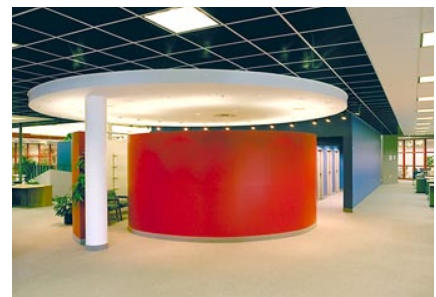
Tetra Rex World Headquarters