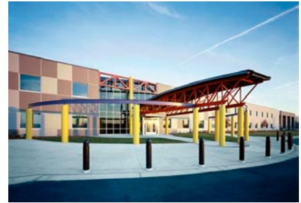
Skyline Displays, Inc.