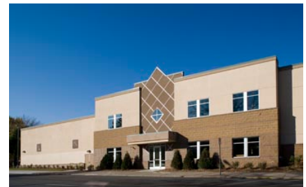
Hmong American Partnership