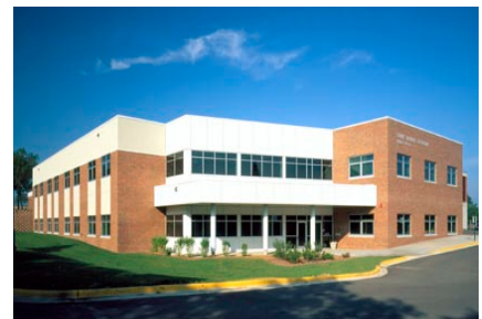
Saint Thomas Academy