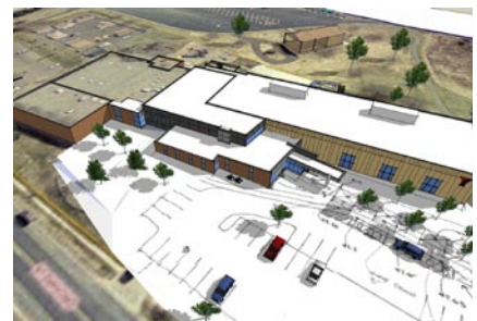
White Bear Area YMCA