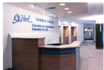
St. Paul Technical College