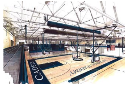
Saint Thomas Academy