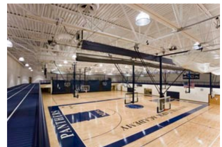
Mounds Park Academy