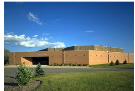
Lakeville Ice Arena