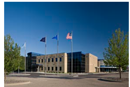
Carpenters Union Apprentice Training Center